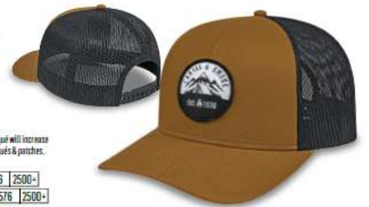
Shown with optional Sewn-on Woven Patch