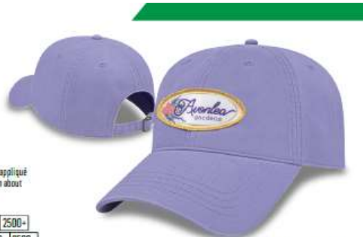
Shown with optional Sewn-on Sublimated Patch